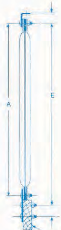
Center vertical mounting part