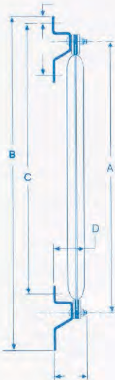
Wall mounting unit part